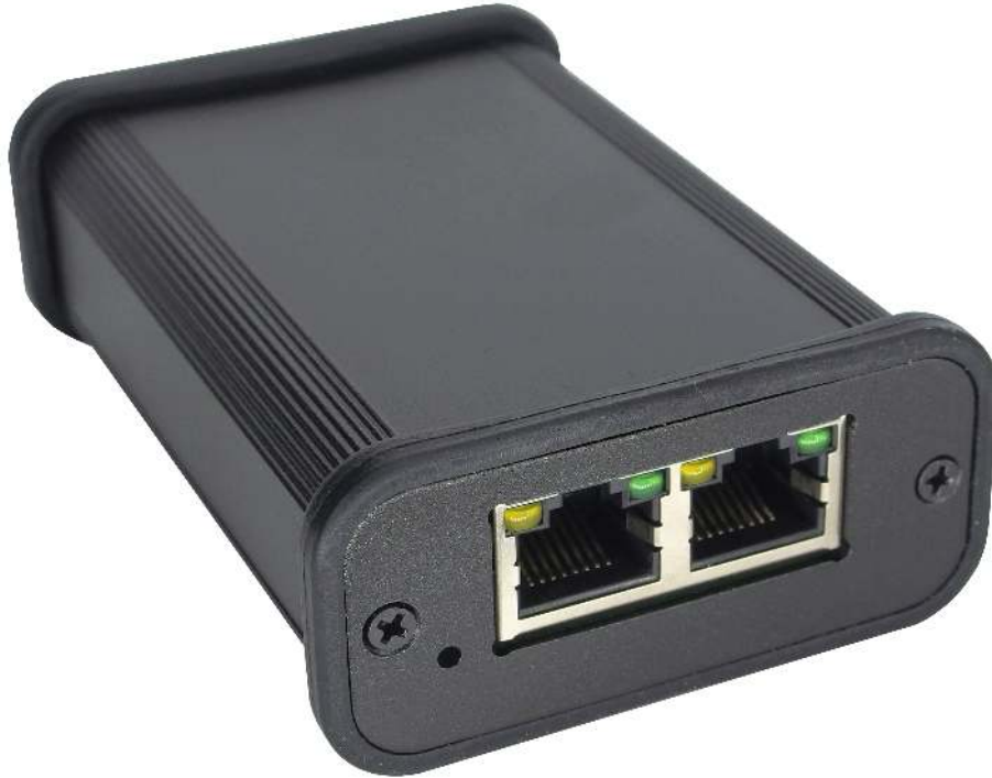
Figure 1: E1 side of icE1usb

From left to right, there are the following connectors: