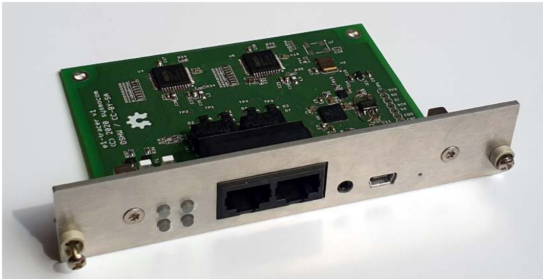
Figure 1: e1-tracer BGT variant

The e1-tracer Hardware consists of a single circuit board, mechanically either assembled into a desktop enclosure (KOH variant) or into a 3U component carrier module (BGT variant).