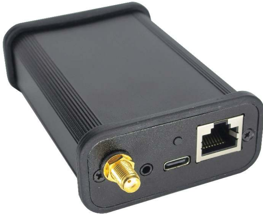
Figure 2: USB side of icE1usb

From left to right, there are the following connectors: