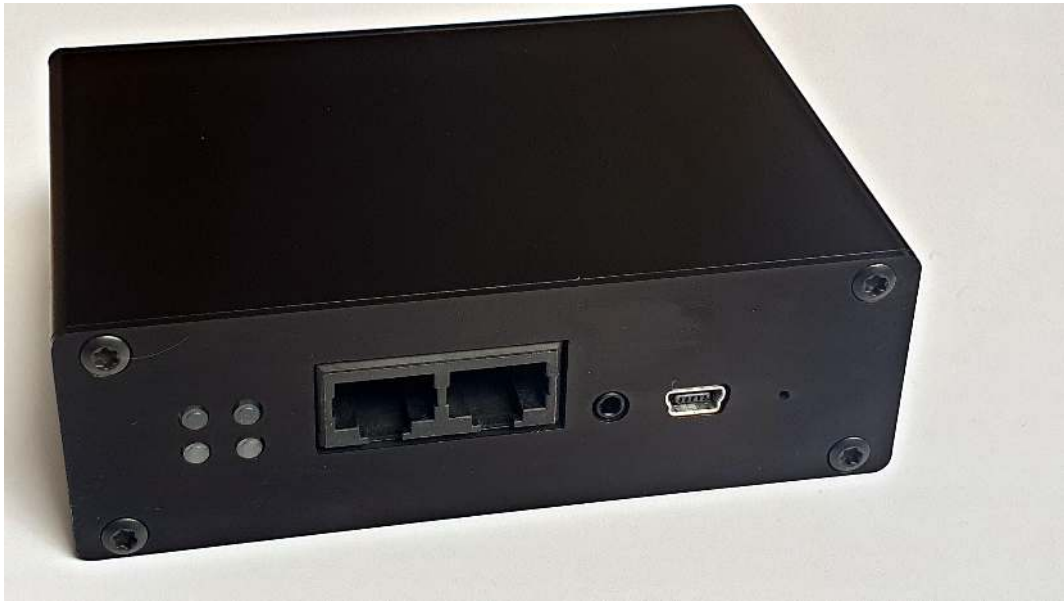
Figure 2: e1-tracer KOH variant